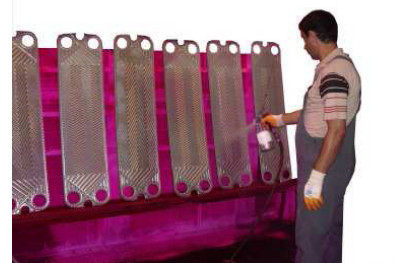
Examination of cleaned plates (metal check)