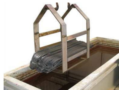
Cleaning of fouled plates