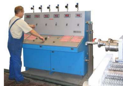
Hydraulic test stand for reconditioned plate packs